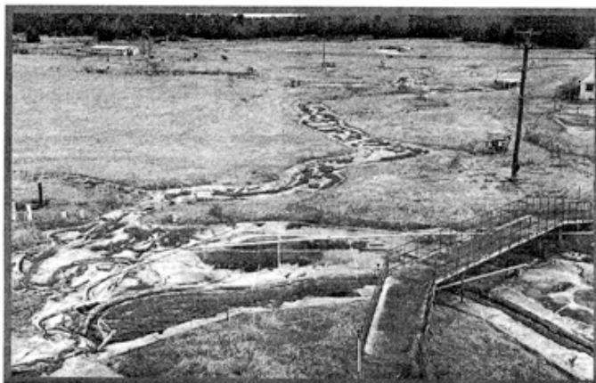
From top: Jeremy Kidd, Lava Lake , 1997, archival print, aluminum panel, plaster, acrylic, 12" x 40"; Adam Belt, Schism , 2002, salt, water, 6' x 8' x 6"; Center for Land Use Interpretation, View of Mississippi River Model , Jackson, Mississippi; S. E. Barnett, Pucker , 2002, 8' x 6' x 2', at the Sam Francis Gallery, Crossroads School for Arts and Science, Santa Monica.

of low-intensity surrealism requires very little beyond the documentation of an already off-kilter reality, View of Mississippi River Model being a solid example. Outside of Jackson, Mississippi, there exists a 1:2000 scale hydrologic model of the entire Mississippi River basin, constructed by the U.S. Army Corps of Engineers to study flood control plans. It now lies abandoned. CLUI's pictures of it embrace an organizational principle that blurs the line between art and science, perhaps irrevocably.